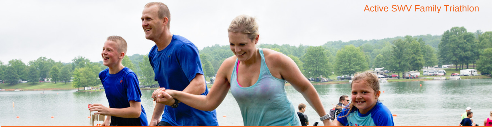
Active SWV Family Triathlon

A report on our grant and donation status for the first half of the year and a look at funding possibilities in progress.